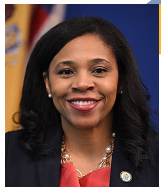
"I come to this position as the child of two public servants who molded me into the person I am today. Having experience at different levels of government has showed me the important role that those of us in public office can play in improving the lives of families across our state."